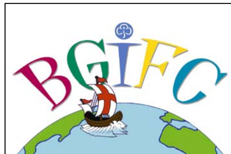
New BGIFC note card design

They will make great Christmas presents.